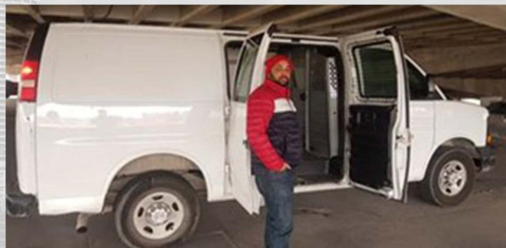
A Chevy 2500 Series Cargo van was purchased to be used for Holiday Meals, Back-to-School Supplies, and to drive Mobile Outreach Initiatives.